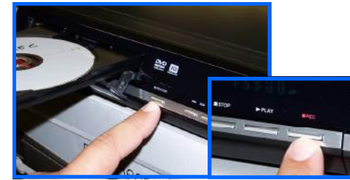
Insert DVD-R then press "record"