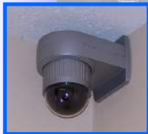
Camera (wall mounted)